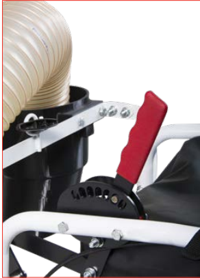
Save time by easily adjusting the nozzle height from the operator's position without stopping.