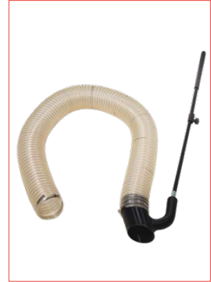
Optional 5" diameter hose kit with adjustable handle provides optimal suction and operator comfort.