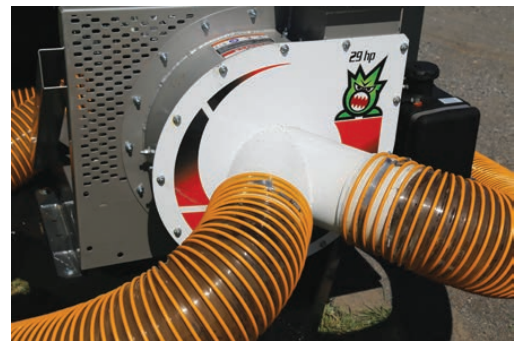
14" housing manifold allows for dual hoses and increased productivity, clearing more waste in less time.

Warranty 2-year Limited Commercial Engines are warranted separately by manufacturer.