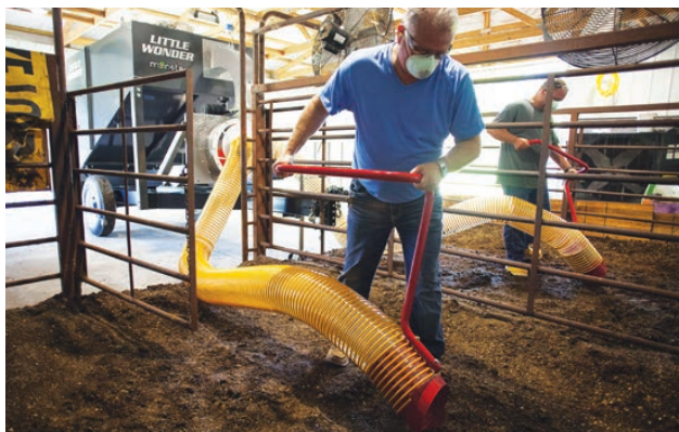
Dual 15' Hoses feature anti-friction, anti-clog smooth-bore interiors, for uninterrupted work