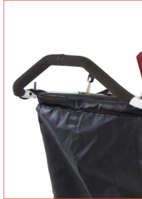
Custom-designed ergonomic, foam-gripped handles prevents user fatigue