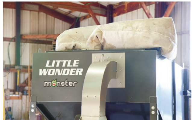
Top-vented with felt bags for increased filtration