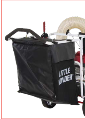
Angled bag with sewn-in plastic bottom prevents wear-and-tear during loading and unloading.